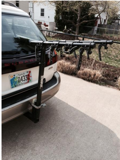
Thule Bike Rack Holds 4 bikes