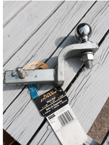
1 1/4 inch hitch

I bought this used last year and gave $90.00. Have not used it. Selling it for $70.00. Contact me if interested at 502-635-1888 .