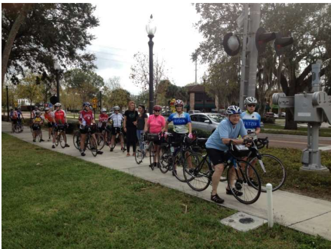
The Campbell Clan