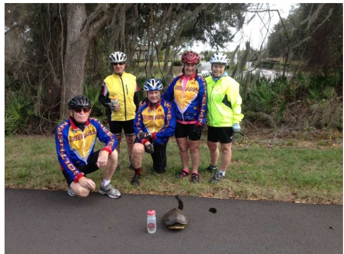
SIW Racing Team