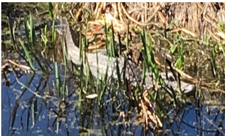
Alligator beside Van Fleet Trail